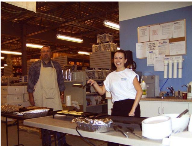
Emco Corp Branch 155 and Waterworks Branch 126, Newfoundland joined together for a pancake breakfast and Chilli Lunch