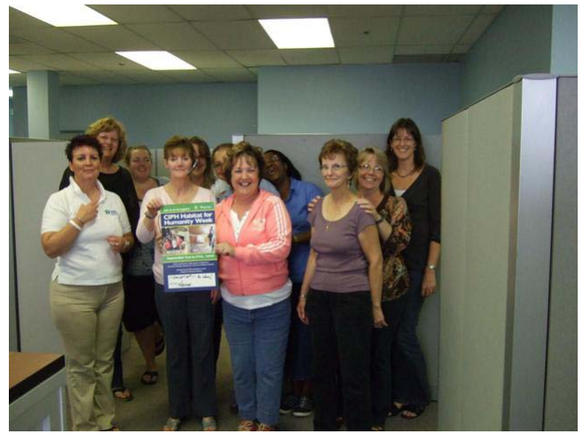
Blanco Canada held a 50/50 Draw, Raffle and Bake Sale