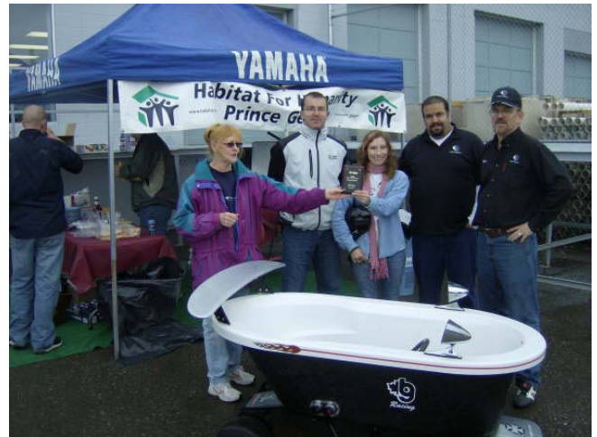
Bartle & Gibson, Prince George, BC Bath Tub Race