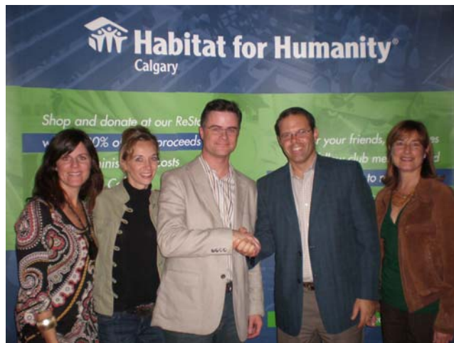
Emco Calgary and silent auction